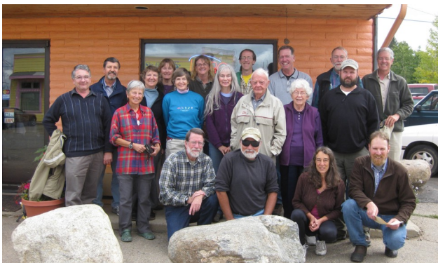
Celebrating 30 years of Indian Peaks Bird Counts