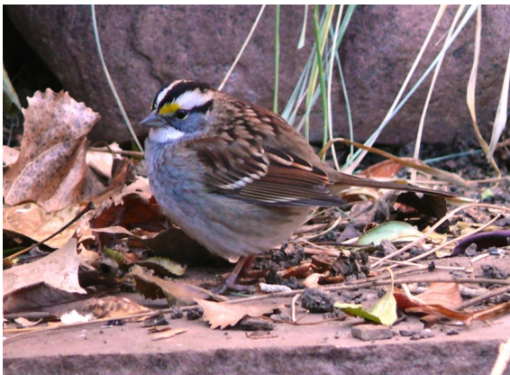
White-throated Sparrow

I have the perfect set-up at my home for the lackadaisical birder, a feeder mounted a few yards west of my office window. Each morning I take a good look at what's pecking before checking email and the day's news. For the last three mornings I've had a very handsome white-throated sparrow scrabbling for spilled patio mix in the leaf mold below the feeder, or perching in the bare forsythia bush. I remember having this species only a few times in my backyard habitat. But when?