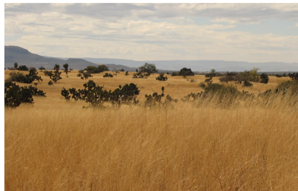
The Malpaís Grassland Priority Conservation Area in Durango and Zacatecas, Mexico