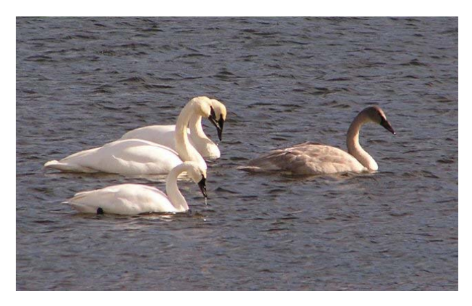
Trumpeter Swans on Barker Reservoir Dorothy Emerling

Dorothy Emerling submitted a striking photo of five trumpeter swans on Barker Reservoir in late November. On the 27th the swans flew down to Boulder Reservoir to get in position for the Christmas Bird Count. Three tundra swans also showed up at Boulder Reservoir that weekend.