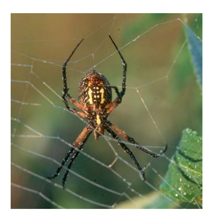
Black and Yellow Garden Spider

Late March: Pasque flowers (Pulsatilla patens), sand lilies (Leucocrinum montanum), and yellow violets (Viola nuttallii) bloom on the Dakota Hogback. The first Swainson's hawks arrive from Argentina. Snowshoe hares and long-tailed weasels begin their prevernal molt. Black-tailed prairie dogs are born. Greenback cutthroat trout spawn.