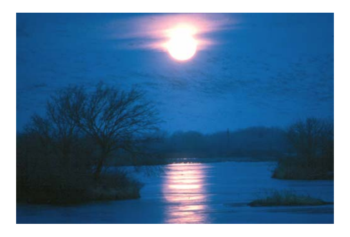
Cranes Taking off from Platte River before Dawn