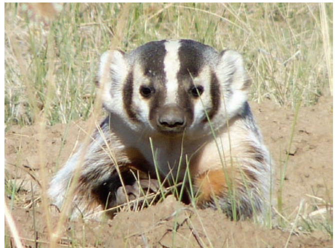
American Badger at entrance of birthing den.