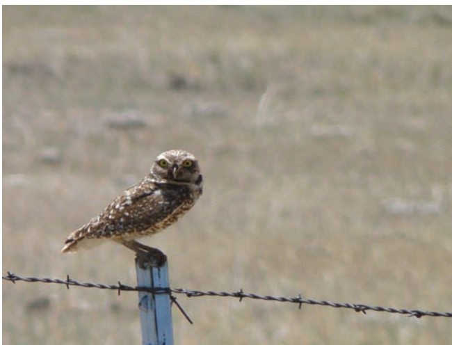
Adult male Burrowing Owl near a nest site in southeast Colorado.

I arrived early, took out my binoculars and scanned available prairie dog colonies. There were plenty of prairie dogs, meadowlarks feeding on the ground, distant horses and cattle, and, of course, great views of the foothills in the Northern Part of the County. My second and third view points were closer to the road and I was met by a number of animals who quickly became my friends. Two of the dogs led me across the field to view prairie dog colonies. As I scanned them, I realized the colonies were of great interest to the dogs as they rooted around in the colonies looking for lunch or some "dogs" to play with. As I moved on to the third of my sites, I was getting used to my companions which now included about eight friendly horses, all interested in what I was doing in their field. Then, as I raised my binoculars to scan the new complex of colonies, I experienced a rather strong shove from the rear, and was surprised to realize that a mule or donkey (not sure which) had taken a keen interest in what I was doing. She was placated by my befriending her and scratching her