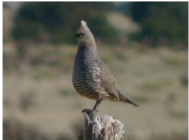
Scaled Quail in southeast Colorado.