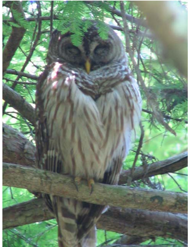
Baby Barred owl, Corkscrew Swamp, Florida.