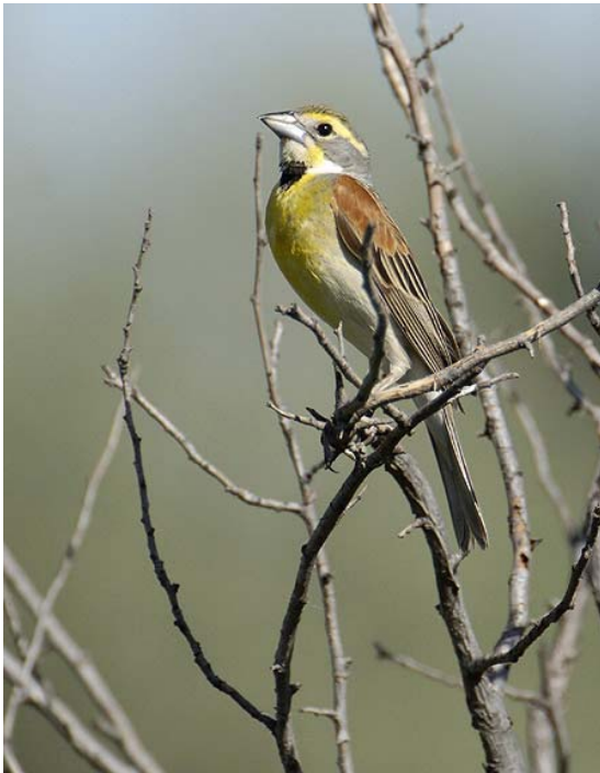
Dickcissel