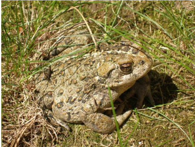
Boreal Toad